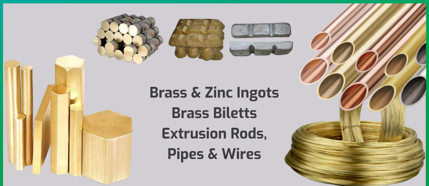
Brass & Zinc Ingots Brass Billetts Extrusion Rods, Pipes & Wires