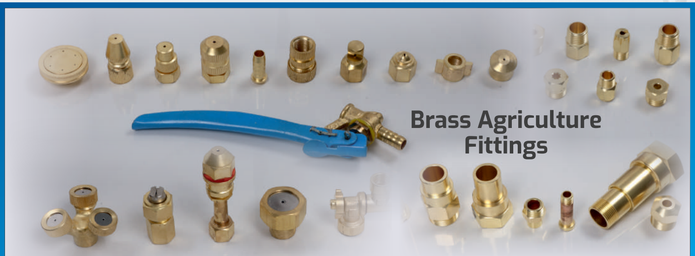
Brass Agriculture Fittings