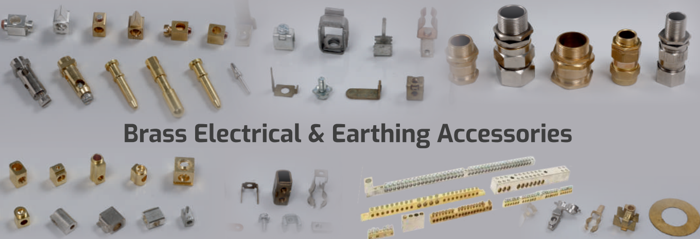
Brass Electrical & Earthing Accessories