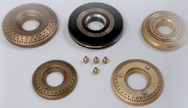
Brass Gas Parts