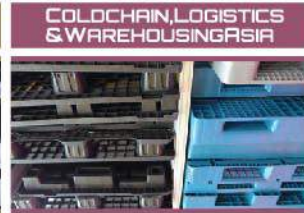
COLDCHAIN, LOGISTICS & WAREHOUSINGASIA

Printech Asia is a dedicated event for converting, package printing and labelling held in-conjunction with ProPak Asia. For more information please go to www.printechasia.com