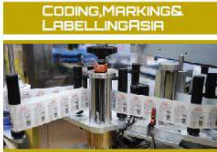
CODING, MARKING & LABELLINGASIA