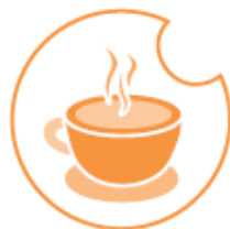
COFFEE & TEA