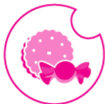
SWEETS & CONFECTIONERY